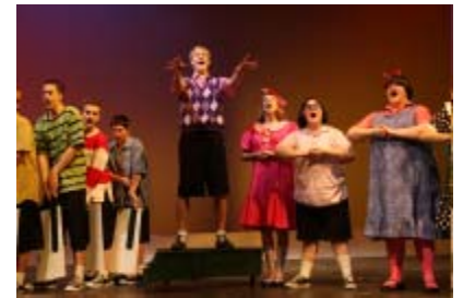
Vista Theatre's 2009 Production of Charlie Brown

The prestigious Honor Guard/Color Guard represents Saint Thomas at wakes and funerals for alumni, community events, games, functions and reviews. The 72-year old Crack Drill Squad handsomely performs around the state.